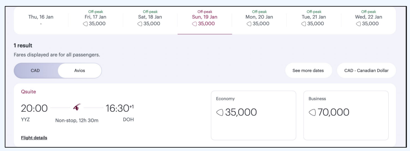
Business-class award booking via Qatar Airways.